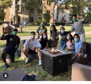
Meet-Up on Library Quad