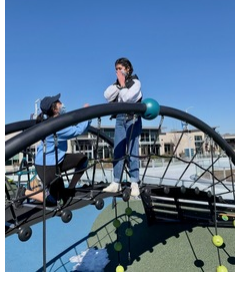
Silly Junior Girls